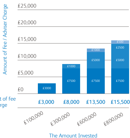
What you will pay based on an example of maximum fees for Advice and Implementation